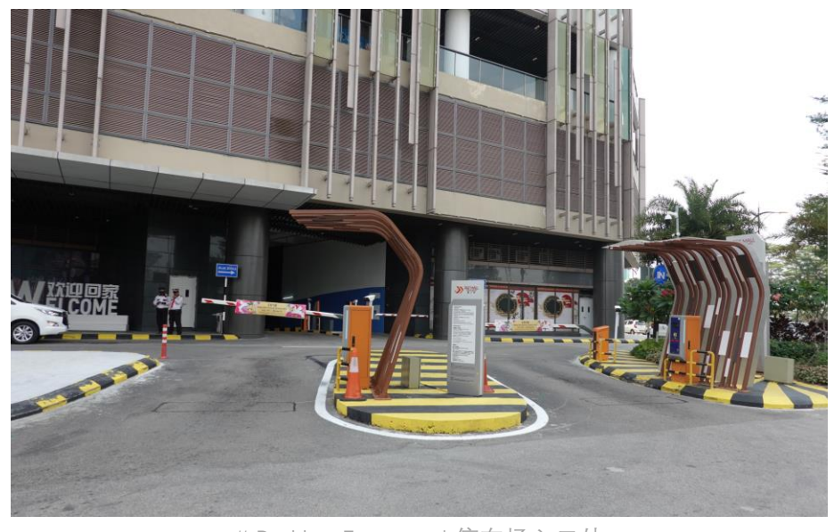
# Parking Entrance | 停车场入口处

Resident Permit Parking Card Holder 住宅停车卡持有者 B1 Parking Visitor Parking Card Holder – White Card 访客停车卡持有者 – 白卡 Exit 出口